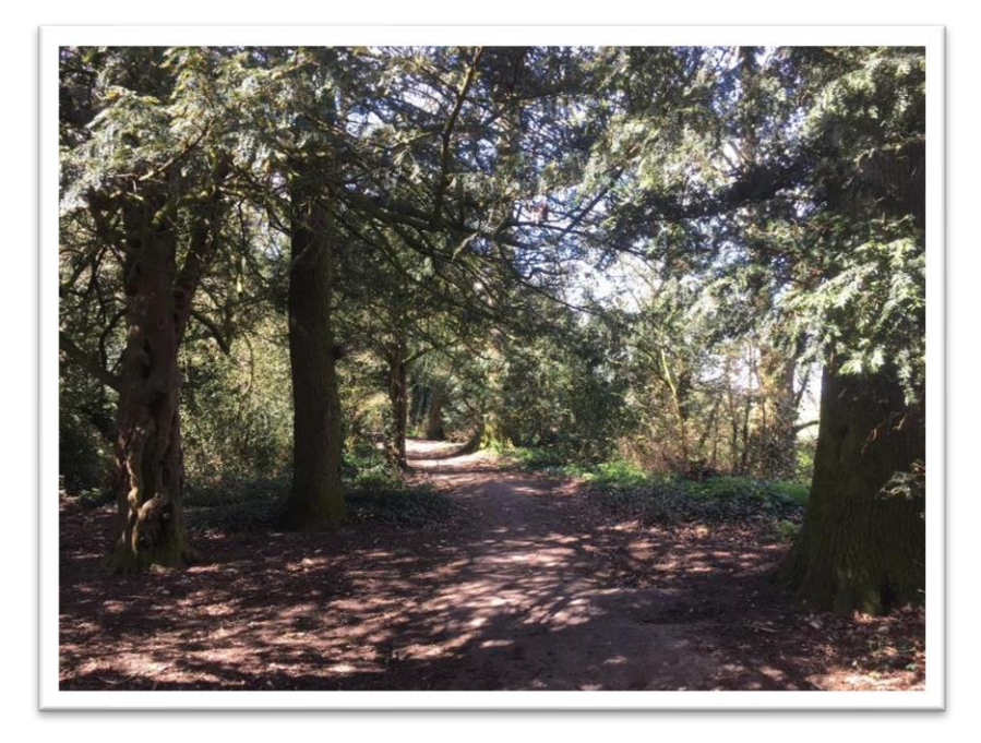
Local Green Space image 1: Swamp Lane Wood, Roydon

Any landowners affected by LGS designation were specifically contacted to make them aware of the potential implications and given the opportunity to provide their views.