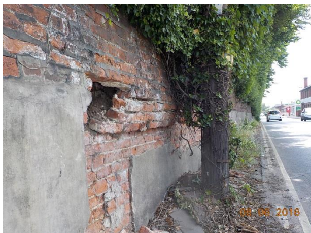
Damage to the wall along Cornard Road

Temporary traffic lights have been installed on Cornard Road in Sudbury while maintenance work is carried out on the wall between Belle Vue Park and the road. The wall has suffered damage from natural sources, including the weight of vegetation and penetration of roots in the soil behind it.