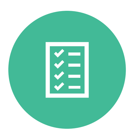
CREATE AND DELIVER A NEIGHBOURHOODS IMPROVEMENT PLAN