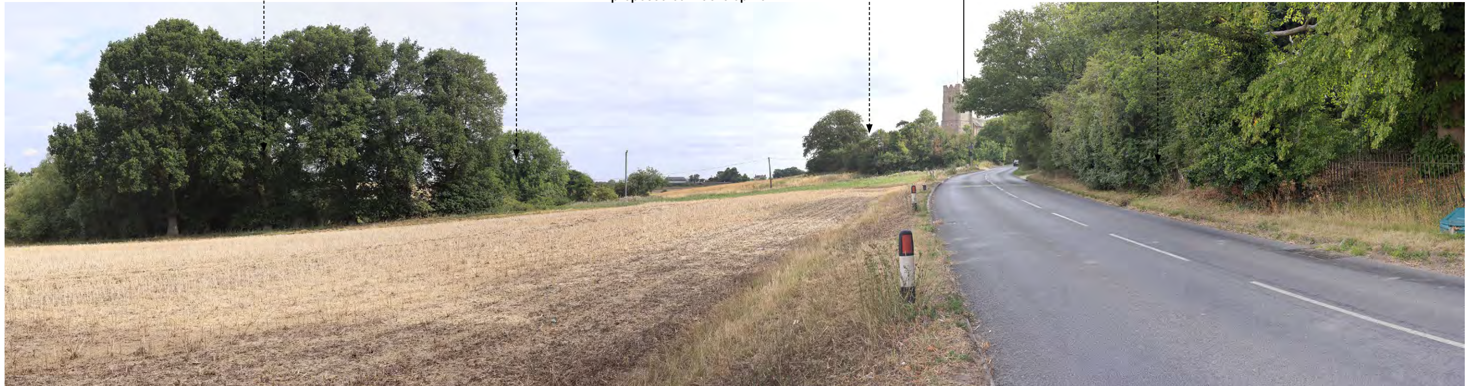
Viewpoint 3: View looking north from Church Road opposite the entrance to the cemetery