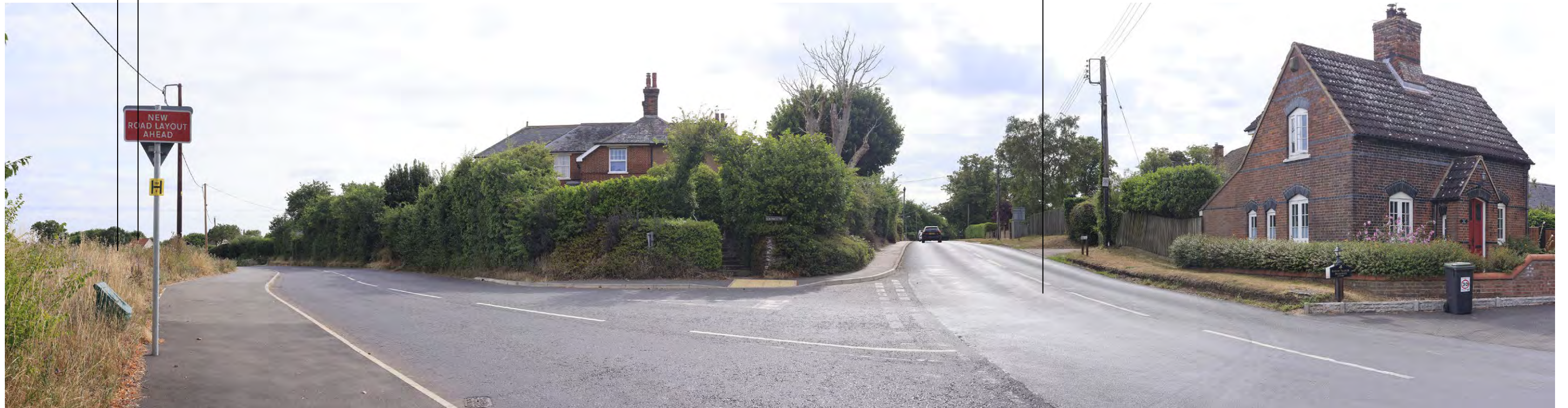
Viewpoint 4: View looking north-east at the junction of Church Road with School Road