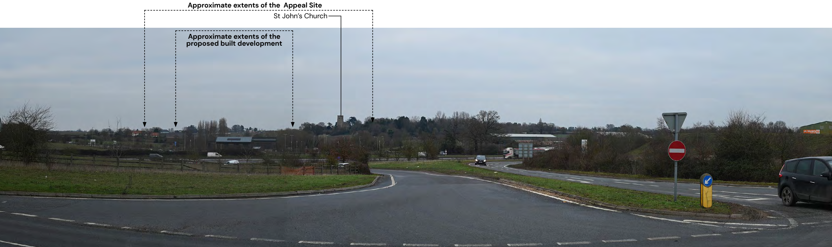
Viewpoint 1: View looking north east from the A14 J.28 at the A1088 / Heath Rd / Black Bourne Ave roundabout