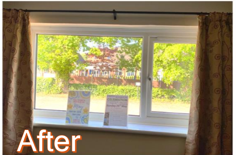
Wilby Village Hall New double-glazed windows